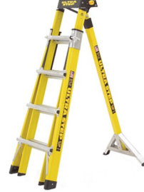
Fiberglass Ultra Step