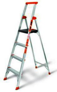
6 feet (3-steps*)