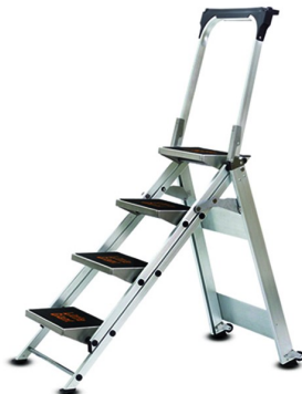
4-step with bar