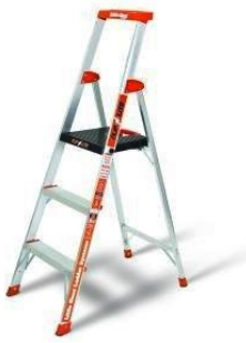
5 feet (2-steps*)