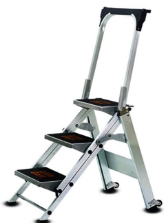
3-step with bar