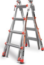
Revolution XE 1A