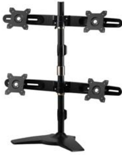
Model : TS744